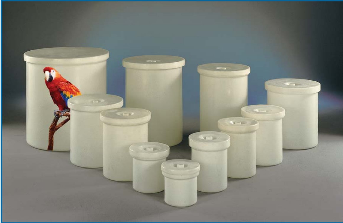
Multi-purpose storage containers for food, chemicals, or small parts.