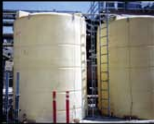
Vertical Free Standing Tanks