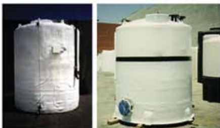
Heat Tracing and Foam Insulation