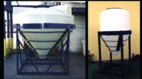
Cone Bottom Tanks