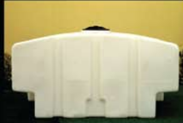
Pick-up Truck Tanks