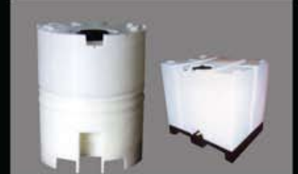
"All Poly" Liquid Transporters