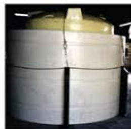
Tie Down Systems and Seismic Restraints