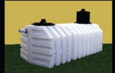
Cistern and Septic Tanks