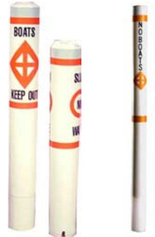
Regulatory Buoy Can Style